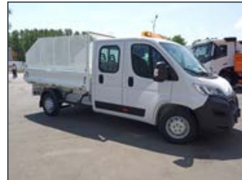
The Aluminium Rear Tipper JPM Original