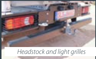
Headstock and light grilles