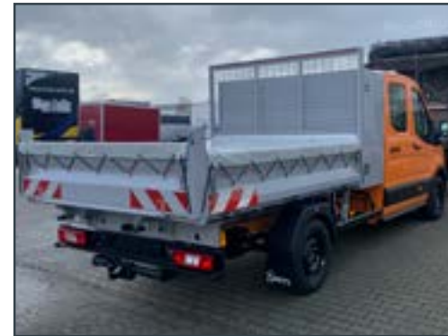
The Aluminium Rear Tipper JPM Original