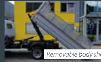
Removable body shell