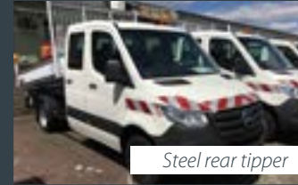
Steel rear tipper