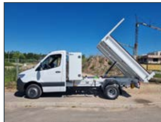
The Aluminium Rear Tipper JPM Original