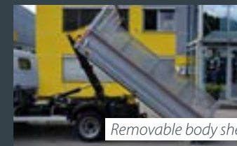
Removable body shell