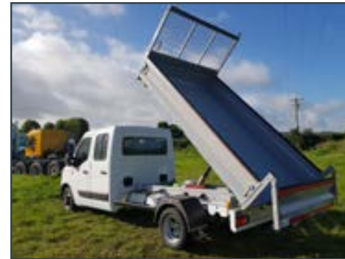
The Aluminium Rear Tipper JPM Original

Payload Up to 1140 kg (Euro VI extended)