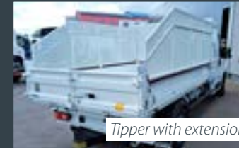
Tipper with extensions