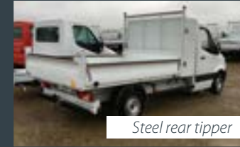
Steel rear tipper