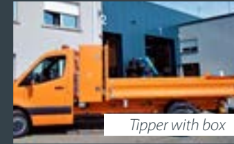
Tipper with box