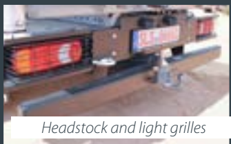
Headstock and light grilles