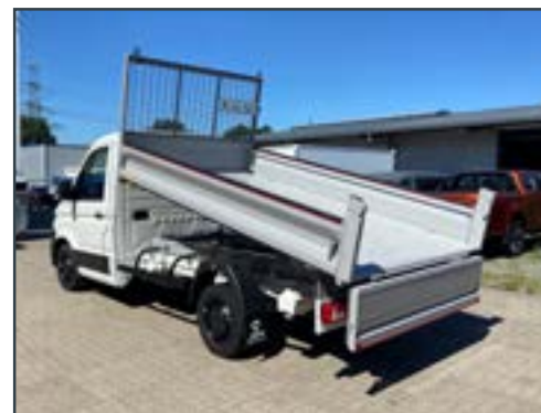
The Aluminium Rear Tipper JPM Original